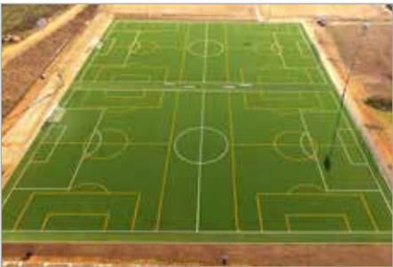
Virginia Youth Soccer Assoc. Headquarters - Fredericksburg, VA