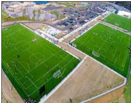
Rocky Mountain Sports Complex - Gatlinburg, TN