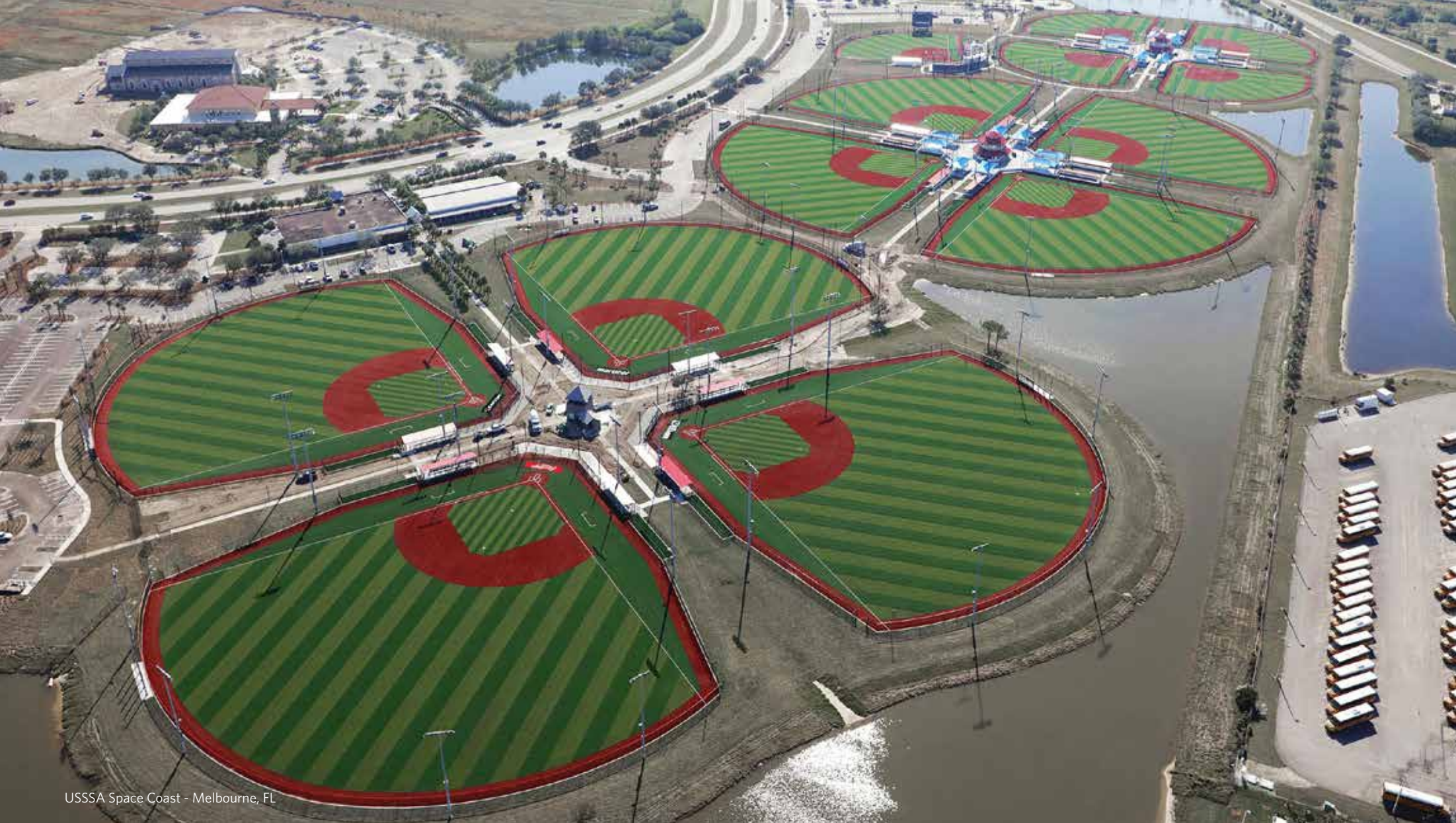
USSSA Space Coast - Melbourne, FL