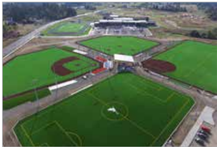
Ridgefield Outdoor Recreation Complex, Ridgefield, WA