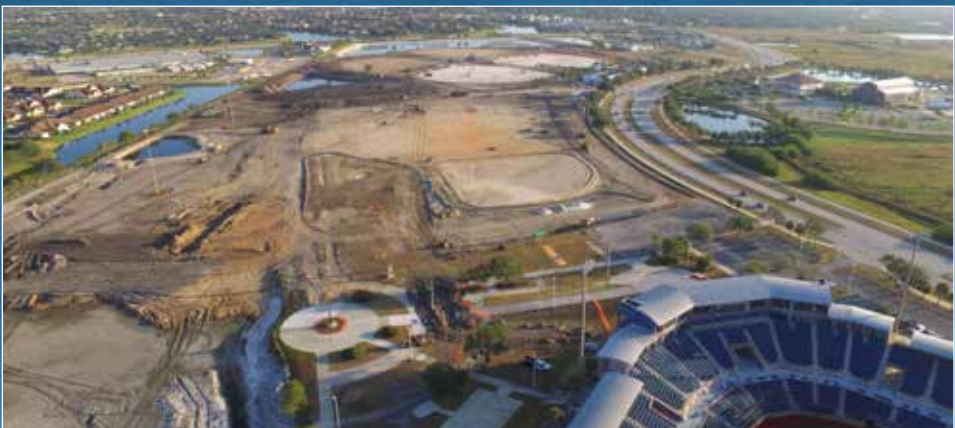
Excavation of the site.

The nation's largest fully synthetic complex and the largest constructed at one time, under one contract.