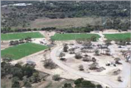
Bee Creek Sports Complex- Travis County, TX

“When we were selecting our Turf vendor, we knew that we wanted partners that could take us from concept to completion. AstroTurf has a great reputation in the industry and a lot of experience in developing complexes like this one. We didn't just want to go big, we wanted to go big and do it the right way and AstroTurf is helping us to do just that. We chose AstroTurf based on product and value, but primarily on their willingness and responsiveness in working with us to get the design of the entire park “just right”. We wanted to be good stewards of the budget we were given. The AstroTurf team helped us achieve that goal! We couldn't be happier.”