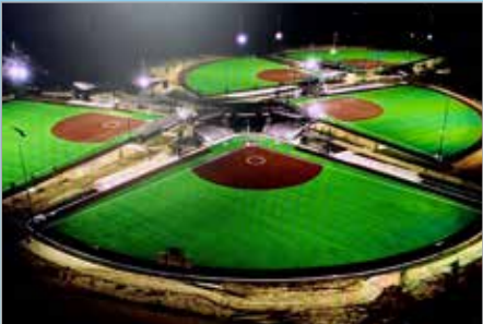
Sand Mountain Sports Complex, Albertville, AL