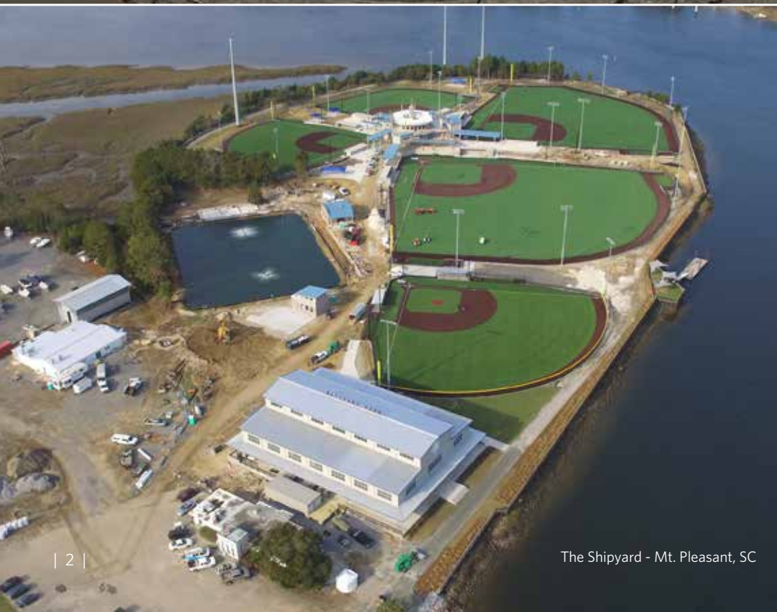
The Shipyard - Mt. Pleasant, SC