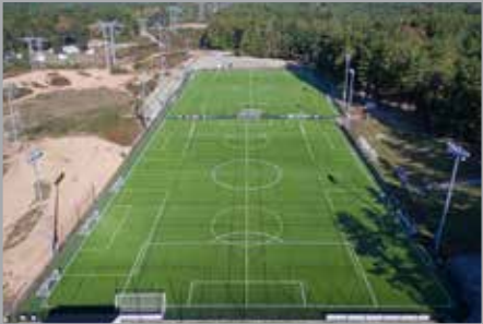
Global Premier Soccer - Bedford, NH