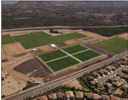
Silverlakes Equestrian & Sports Park - Norco, CA