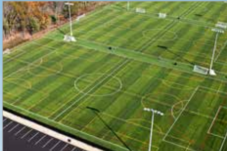
ForeKicks Soccer - Taunton, MA