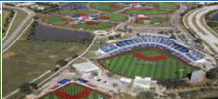
USSSA Space Coast - Melbourne, FL