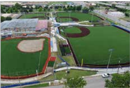
Kansas City Urban Youth Academy - Kansas City, MO