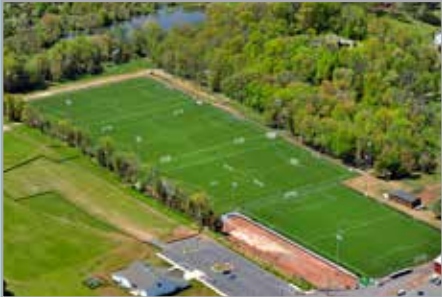
Evergreen SoccerPlex - Leesburg, VA