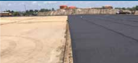
Installing the geotextile liner.