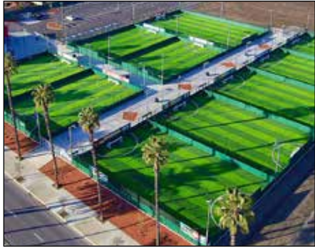
Goals Soccer Complex - Pomona, CA