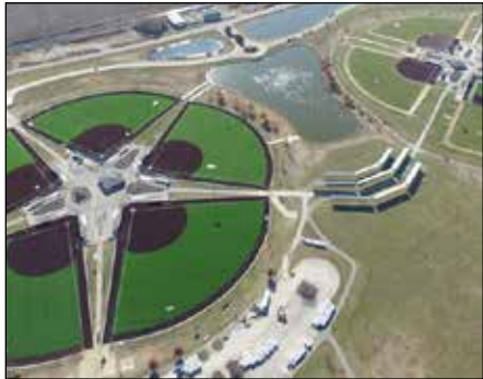
Fountain Bluff Sports Complex, Liberty, MO