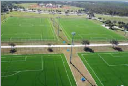
Paradise Sports Complex, Naples, FL