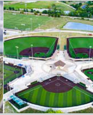
Z-Plex Texas Sports Village - Melissa, TX