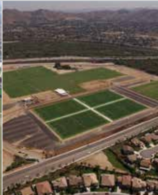
Silverlakes Equestrian & Sports Park - Norco, CA