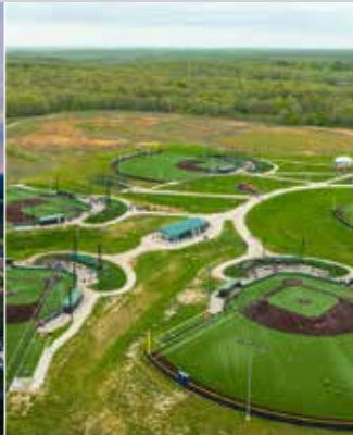
Ballparks National - Macks Creek, MD