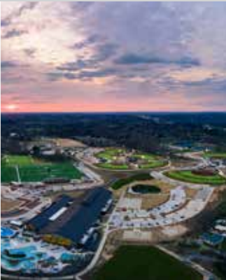
Sand Mountain Park - Albertville, AL(1)