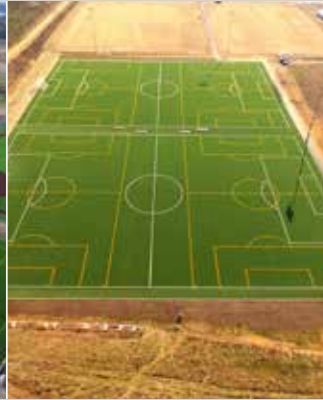
Virginia Youth Soccer HQ. - Fredericksburg, VA