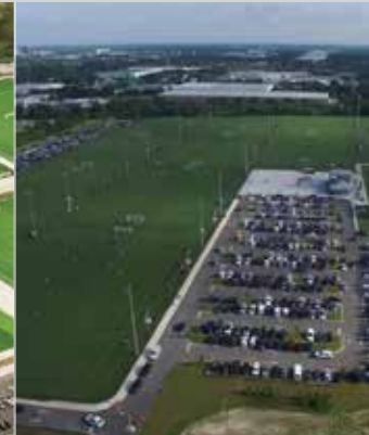
Hillsborough County Sportsplex - Tampa, FL