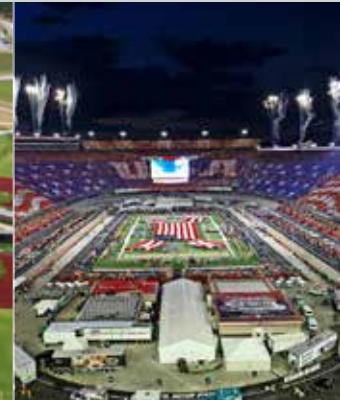
Bristol Motor Speedway - Bristol, TN