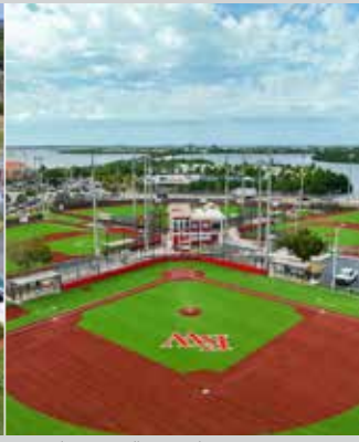
Clayton Sterling Complex - Key West, FL