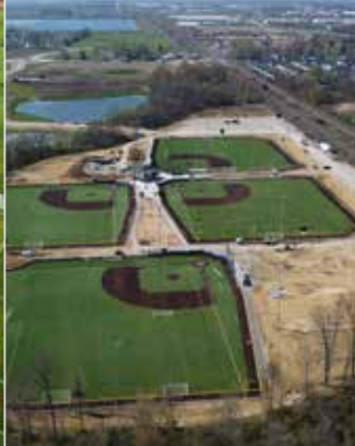
Jennings Sports Park - Delaware County, OH