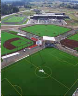
Ridgefield Outdoor Rec. Complex, Ridgefield, WA