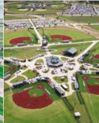
James Oates Park - Dothan, AL