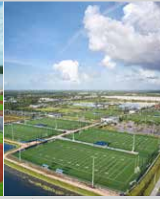
Paradise Coast Sports Complex - Naples, FL(1)