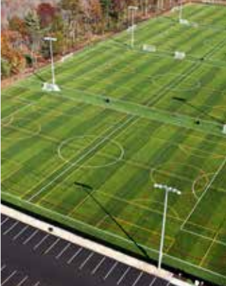
FareKicks Soccer - Taunton, MA