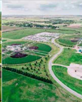
Bickle-Schmidt Sports Complex - Hays, KS