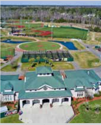
The Ripken Experience - Myrtle Beach, SC