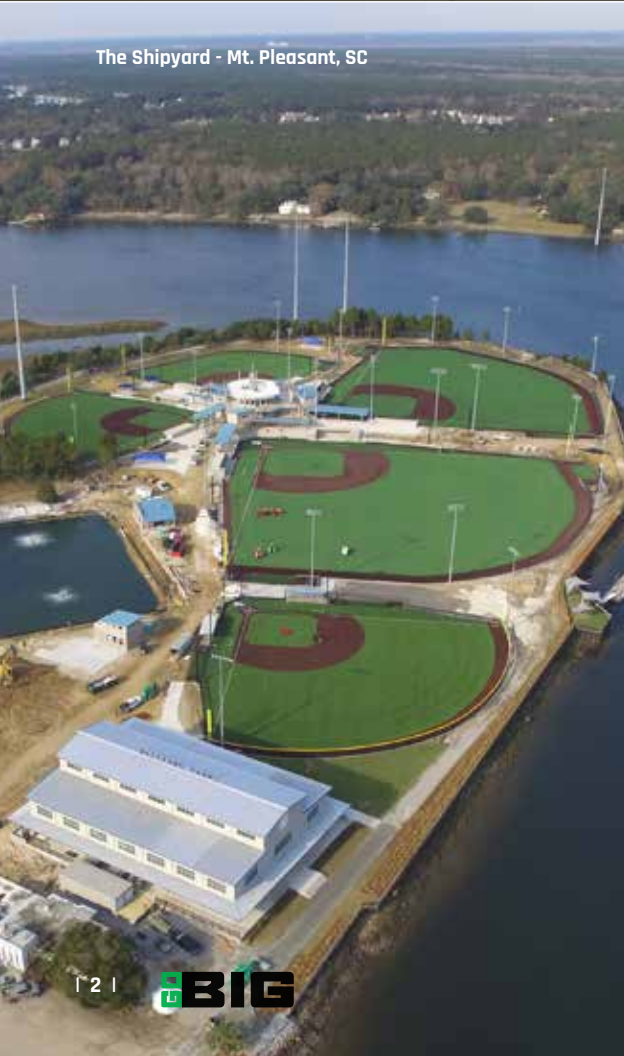
The Shipyard - Mt. Pleasant, SC