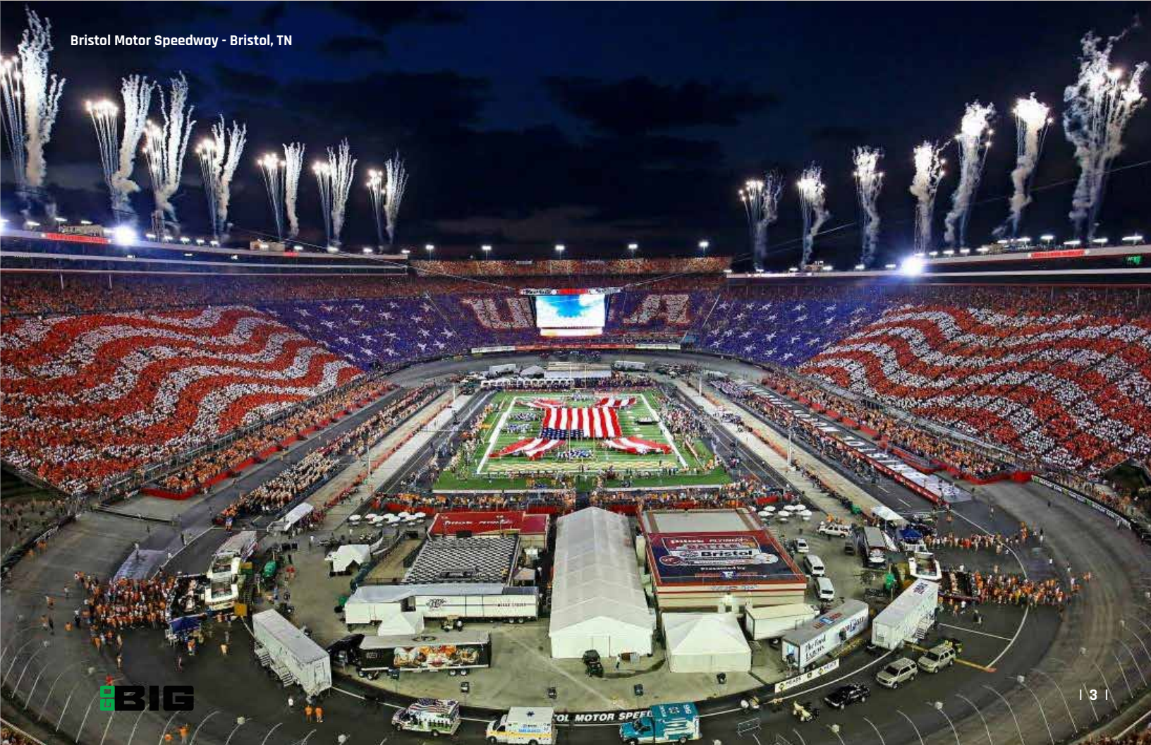
Bristol Motor Speedway - Bristol, TN

Just as sports tourism facilities provide a one-stop destination for teams and families, AstroTurf serves as an indispensable partner in the process – standing side by side during the entire process.