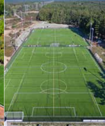
Global Premier Soccer - Bedford, NH