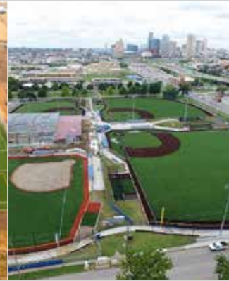
Kansas City Youth Academy - Kansas City, MO