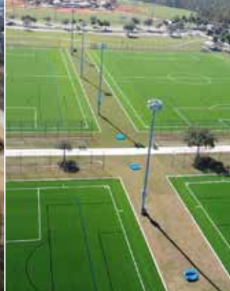
Paradise Sports Complex, Naples, FL