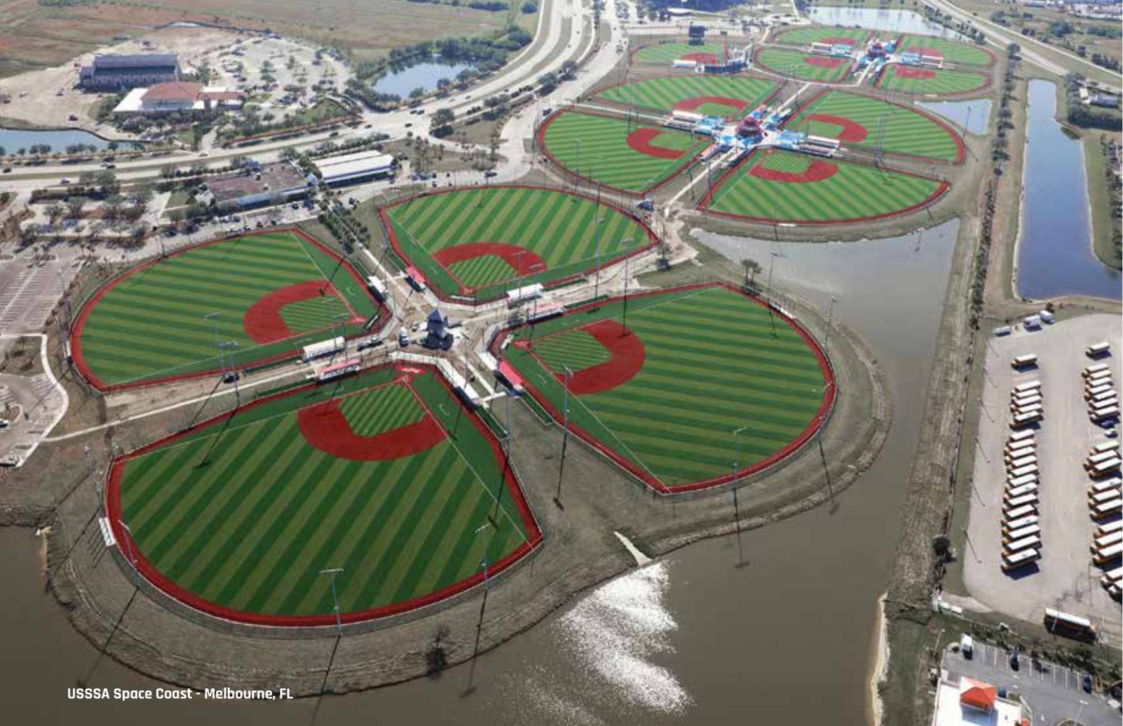
USSSA Space Coast - Melbourne, FL