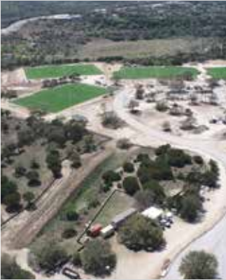
Bee Creek Sports Complex- Travis County, TX