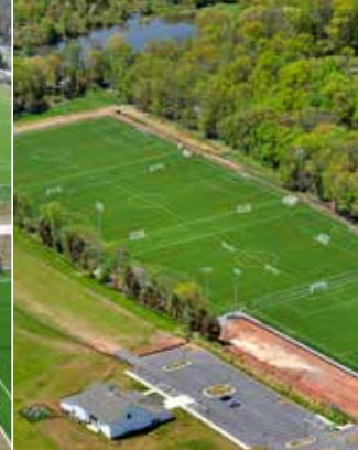
Evergreen SoccerPlex - Leesburg, VA