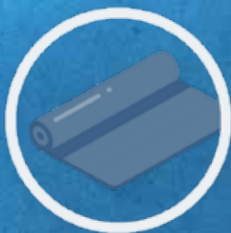
Installing the Geotextile Liner