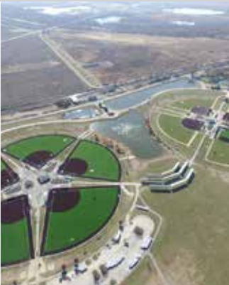
Fountain Bluff Sports Complex, Liberty, MO