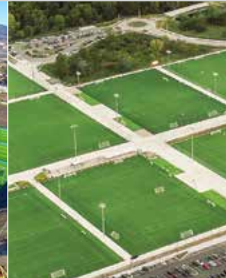
Paragon Star Sports Complex - Lee's Summit, MO