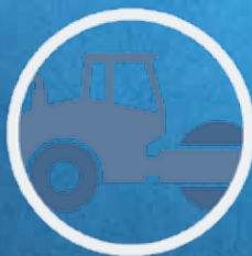
Building and Compacting the stone base