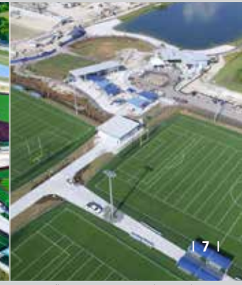
Paradise Coast Sports Complex - Naples, FL