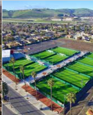
Goals Soccer Complex - Pomona, CA