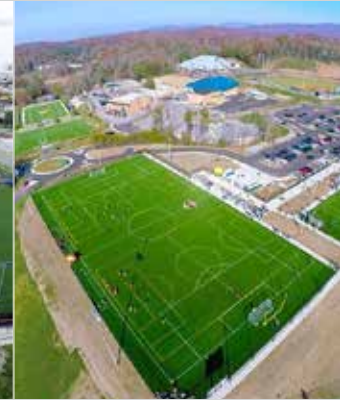
Rocky Mountain Sports Complex - Gatlingburg, TN